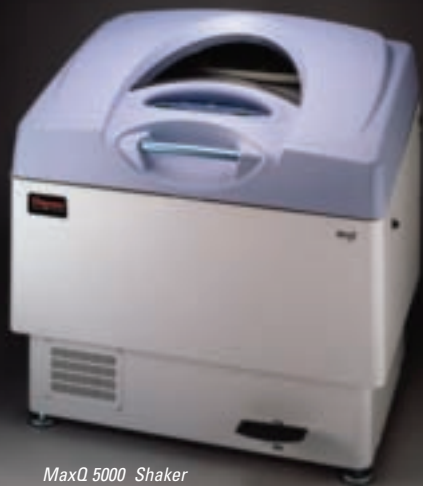
MaxQ 5000 Shaker Cat. No. SHKE5000