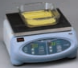
MaxQ 2000 Shaker Cat. No. SHKE2000