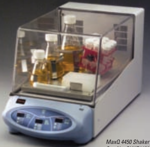
MaxQ 4450 Shaker Cat. No. SHKE4450