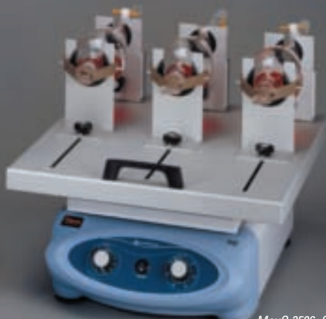
MaxQ 2506 Shaker Cat. No. SHKA2506