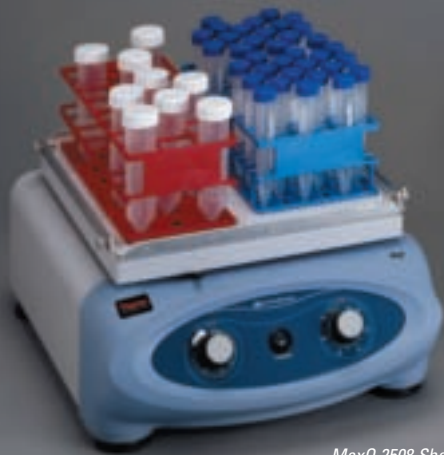
MaxQ 2508 Shaker Cat. No. SHKA2508