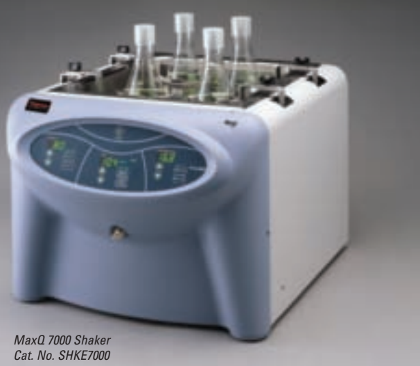
MaxQ 7000 Shaker Cat. No. SHKE7000