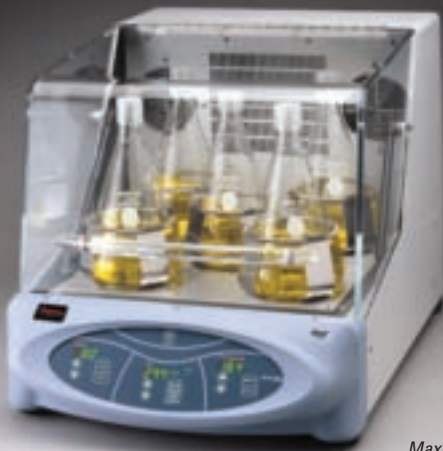
MaxQ 4000 Shaker Cat. No. SHKE4000