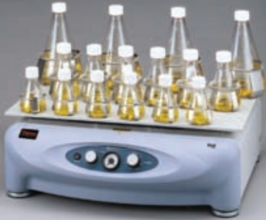
MaxQ 3000 Shaker Cat. No. SHKA3000