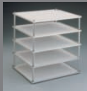
Five-Tier Blood Bag Platform Cat. No. 3523-51