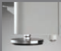
Retractable foot casters allow easy manipulation in lab.