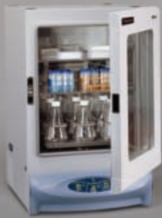
MaxQ 6000 Shaker Cat. No. SHKE6000