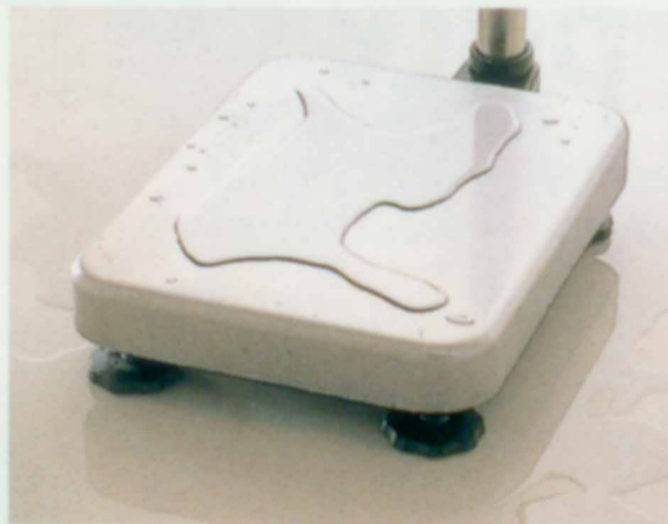
Stainless Steel Weighing Pan