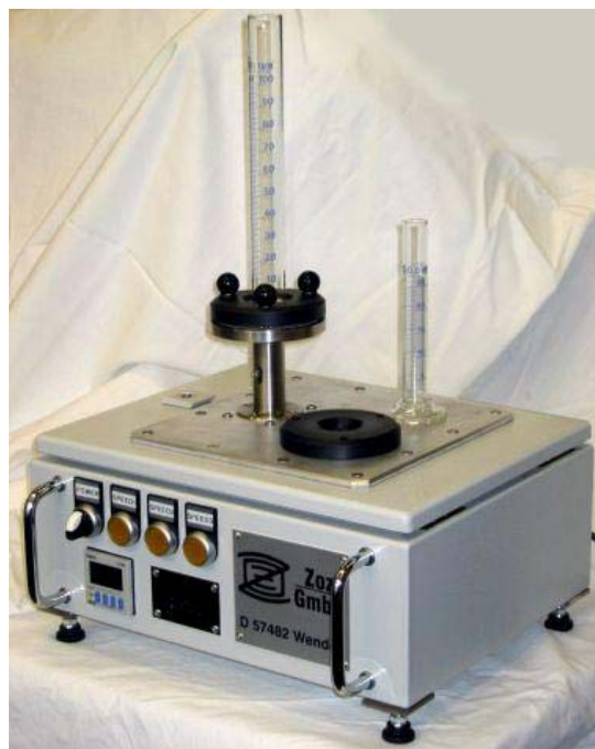
Densitometer KDM01 with test-cylinders 25 & 100ml