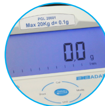
Large backlit display