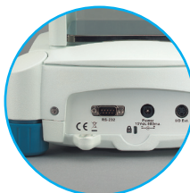
RS-232 Interface, security slot and level