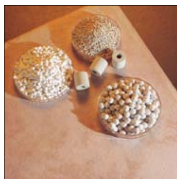
Catalysts and Ceramics