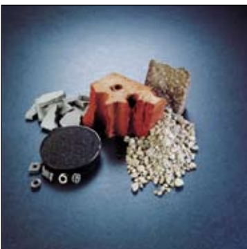
Powder Metals and Construction