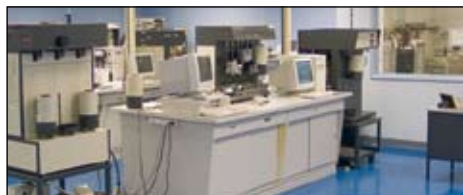
Quantachrome Instruments Application Laboratory.

Quantachrome is also recognized as an excellent resource for authoritative analysis of your samples in our fully equipped, state-of-the-art powder characterization laboratory.