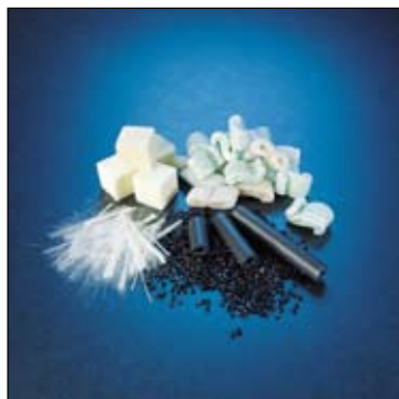
Foams and Fibers