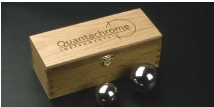
NIST traceable calibration spheres.