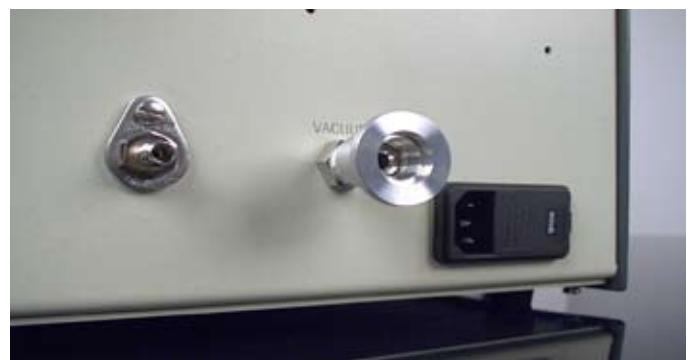
Gas Input and Vacuum Fittings