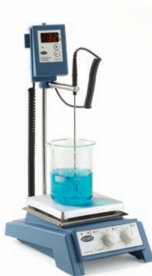
SC162 with SCT1