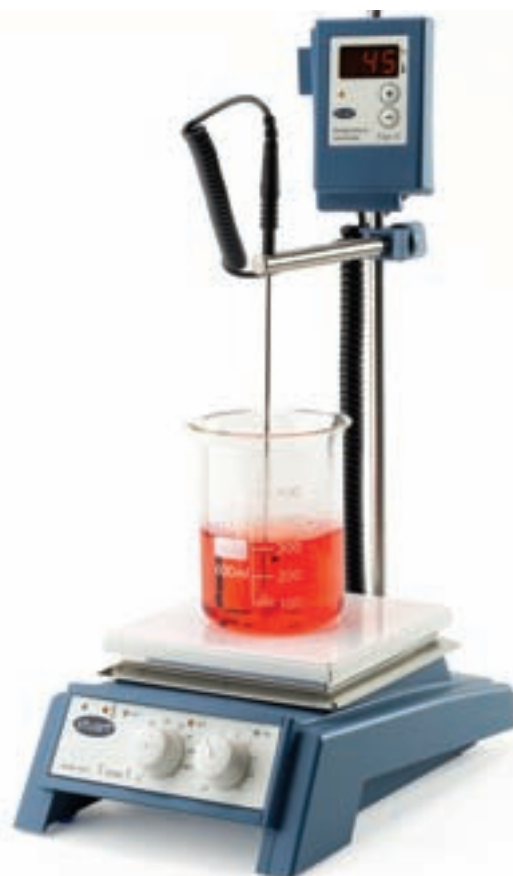
CC162 with SCT1