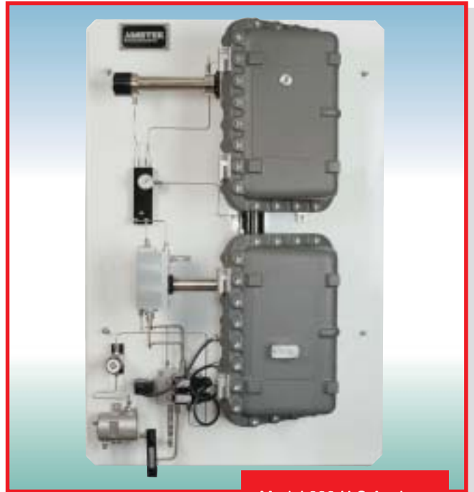
Model 933 H 2 S Analyzer

The Model 933 utilizes two onboard microprocessors that provide concentration calculations, data processing, calibration, sophisticated self-diagnostics, and column switching control.