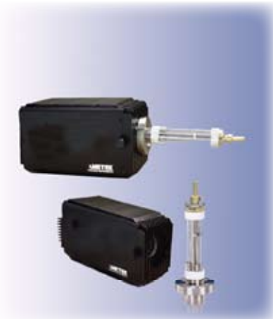
Analyzer head and electronics unit.