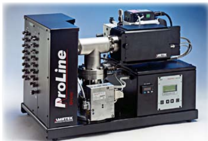
The ProLine comes complete with multiport automatic valve switching, inlet manifold, and turbomolecular pumping package.

The compact modular design of the ProLine sets a new standard in serviceability. The mass spectrometer electronics are contained in a single, easily replaced, plug-in unit. No electronic calibrations are necessary—the electronics unit will mate with any analyzer head. An inexpensive spare analyzer head and electronics unit can be kept on the shelf and easily exchanged by your own personnel on-site. There is no need for the expensive service contract typical of most process mass spectrometers. Self-diagnostics and automatic device event logging ensure GMP compliance. Modem support is available for additional factory diagnosis and troubleshooting.