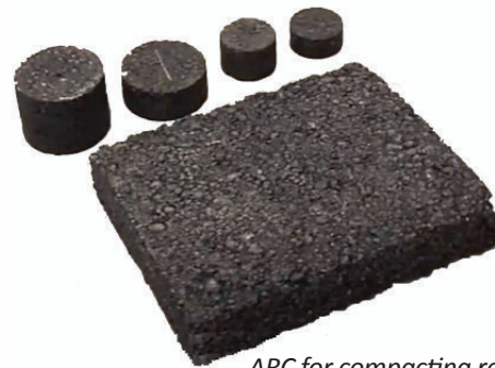
ARC for compacting repeatable asphalt samples