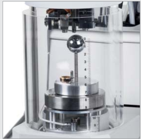
Carbon Rod Evaporation by indirect evaporation using a shadowing sphere.