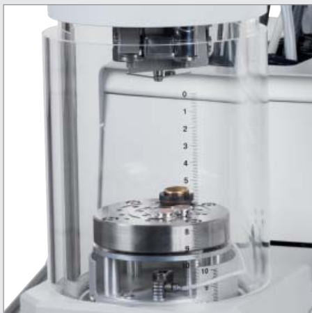
Thermal Resistance Evaporation for the production of a 2-layer system using either carbon, metal, non-metal or organic substances.