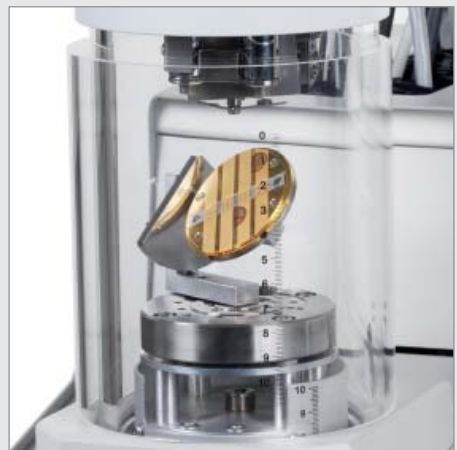
Thermal Resistance Metal/Carbon Mix Coating for normal, portrait and rotary shadowing under pre-selectable coating angles.