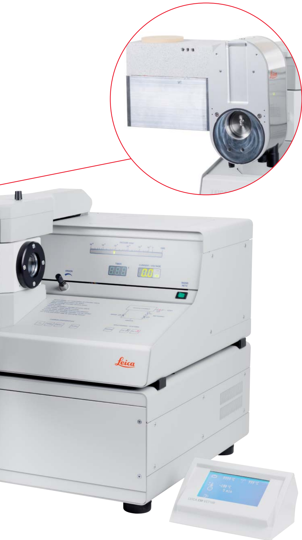
Docking Station and LN 2 Dewar