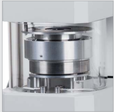
High vacuum sputtering using the rotary stage, specimen clips and quartz head.