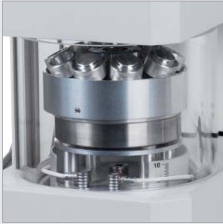
High vacuum sputtering using the planetary drive stage, SEM specimen mounts, stubs and quartz head.