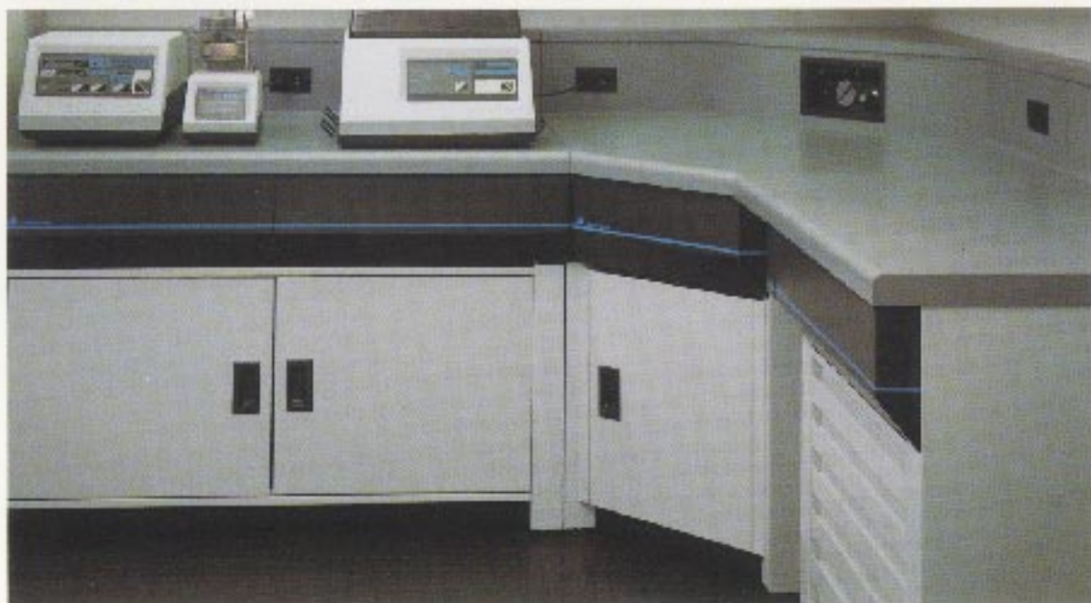
Corner Tables provide efficient continuous counter top surfaces. Seamless backplashes and optional Resport shelves add convenience and utility access space.