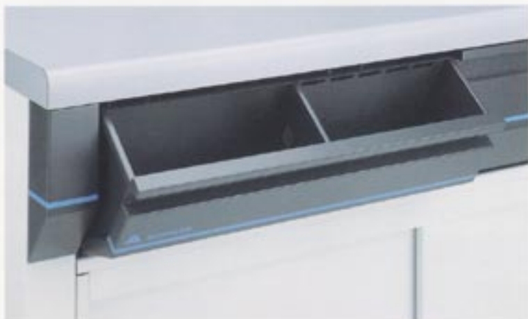
Built-in Storage Bins provide handy access locations for tools and instruction manuals.