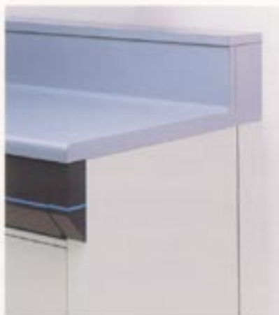
Reagent Shelves, End Filler Kits, and Fascia Panels give your laboratory installation a finished look.