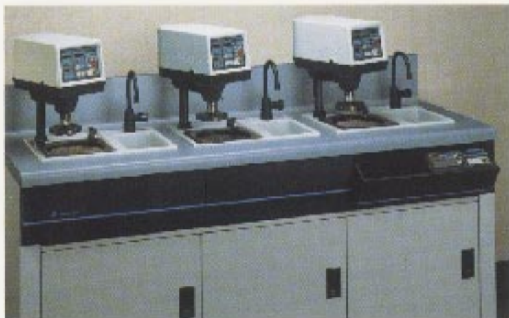
The TECH-MET® Laboratory Furniture line also accommodates BUEHLER® flush-mounted grinder/polishers.

BUEHLER can help in the development of your laboratory through design recommendations, facility planning, and expense-free guidance and consultation. Whatever your laboratory furniture requirements, rugged, versatile, contemporary TECH-MET® Laboratory Furniture is the ideal choice for the materials analysis laboratory.