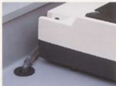
Table-Top Cup Drains provide convenient access for equipment drainage.