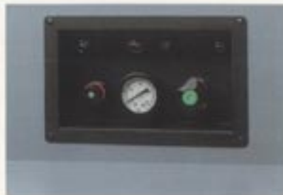
Optional Service Modules provide water and compressed air utilities. Duplex receptacles provide 115V electrical power.