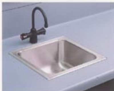
Stainless steel sinks and faucets may be located as needed.