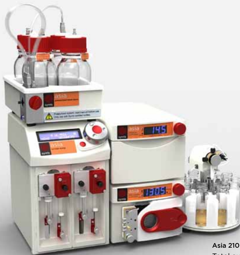
Asia 210 System

Total automation of reaction temperature, reaction time, flow rates and single product collection.