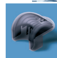
Freely rotatable stand for handy storage of Transferpette® S and Transferpette® S -8/-12 pipettes