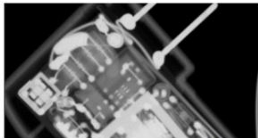
The above photo is a comparison photo taken with a regular X-ray detector.

Reveal™ is capable of performing in a multitude of environments. The tethered configuration provides rapid data transfer, and its wireless capabilities deliver flexibility and increased reach. The portability and wireless capabilities of the X-ray device make it ideal for both fixed and mobile applications.