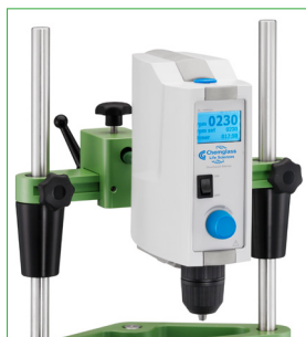
6a Digital Overhead Stirrer, 115v

Approx. Stand Dimensions: 15.25 W x 17.25 D x 44”H