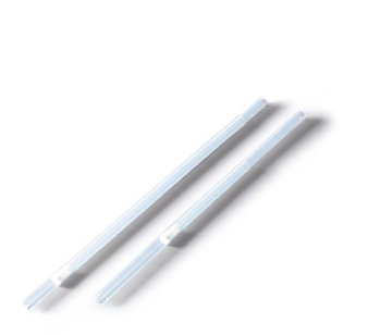
Telescoping filling tube FEP