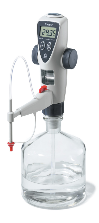
Titrette® Nominal volumes: 10 ml, 25 ml und 50 ml

The Titrette® is light and compact, and thanks to its robust design it can also be used where space is limited, with no power connection required. The compact design and low weight ensure high stability. The instrument can be disassembled in a matter of minutes – for cleaning, to replace the dispensing unit or to replace the batteries. And with Easy Calibration technology, you can make calibration adjustments on the instrument quickly and easily without any tools. Discover how easy and efficient precision titration can be with the Titrette® bottle-top burette.