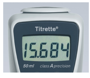
Precise working within the Class A error limits