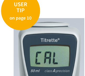
Additional electronic functions for efficient work