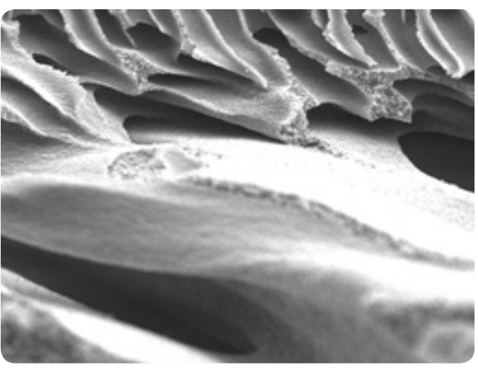
New void-free Biomax®-10 modified polyethersulfone membrane.