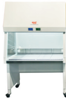
HMC BSC 1200 The classic size

Perfect for challenging tasks in the smallest spaces