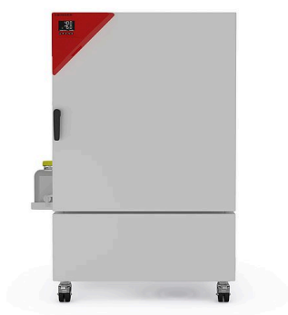
Model KBF-S ECO 240