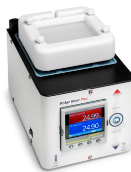
Polar Bear Plus GSM™ reactor