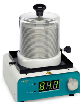
HotCoil™ heated coil reactor