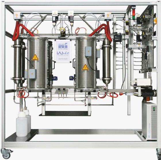
4-fold parallel reactor plant for catalytic converter tests, pressures of up to 120 bar, 3-stage reactions, continuous operation