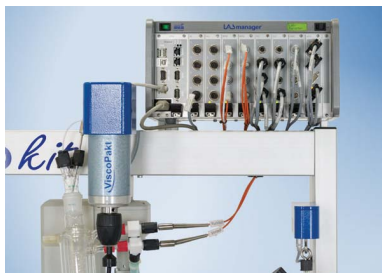
LabManager® can be installed space-saving on a construction

LabKit™ makes use of the capabilities of the HiTec Zang LabManager® system. It offers simple programming and operation, universal interfaces with distinctive plug connectors and excellent robustness. LabManager® systems can be operated in fume cupboards.