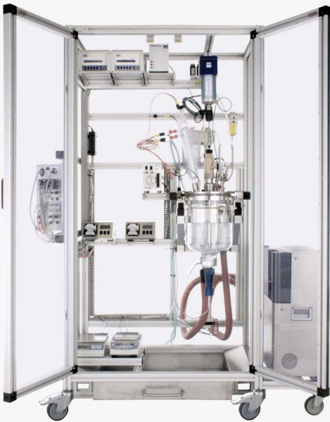
Laboratory calorimeter with a 5-litre glass reactor with a stainless steel lid, heat balance calorimetry and extensive sensors