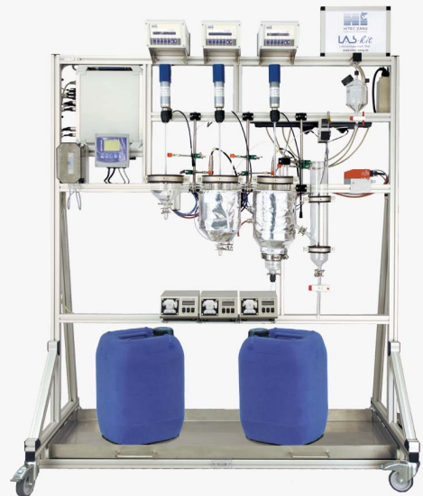
Laboratory clarification unit with pH, turbidity and foam sensors, stirred tanks in continuous operation