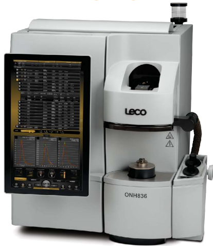
Shown with touch-screen monitor.