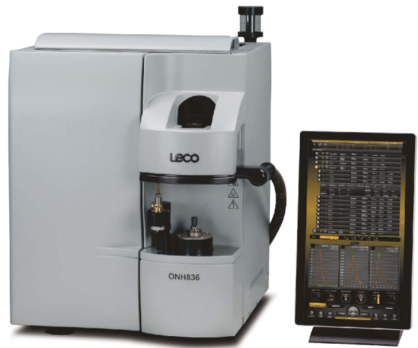
Shown with optional autocleaner and stand-alone touch-screen monitor.