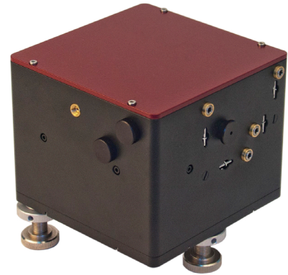
The AA-20DD optical unit