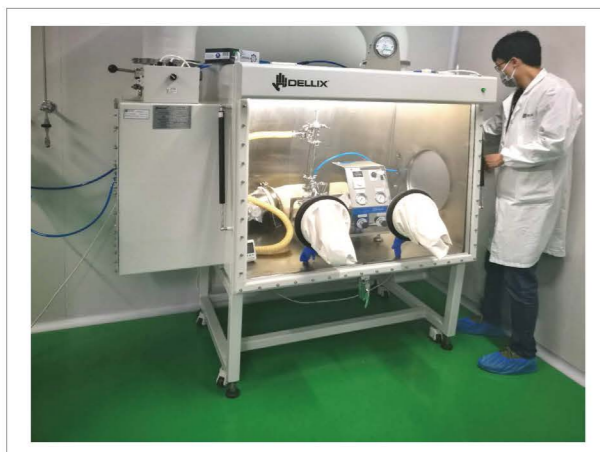
实验型 Lab type