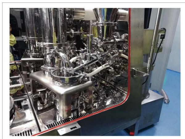
中试型 Pilot type