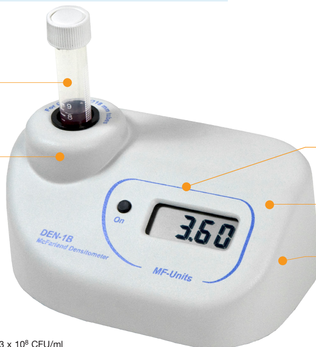
DEN-1B densitometer shown

DEN-1 and DEN-1B units are calibrated for operation in range 0.3-15.0 McF and 0->15.00 McF, but it is possible to measure turbidity from 0McF to 15McF (note: the standard deviation of the values increases).