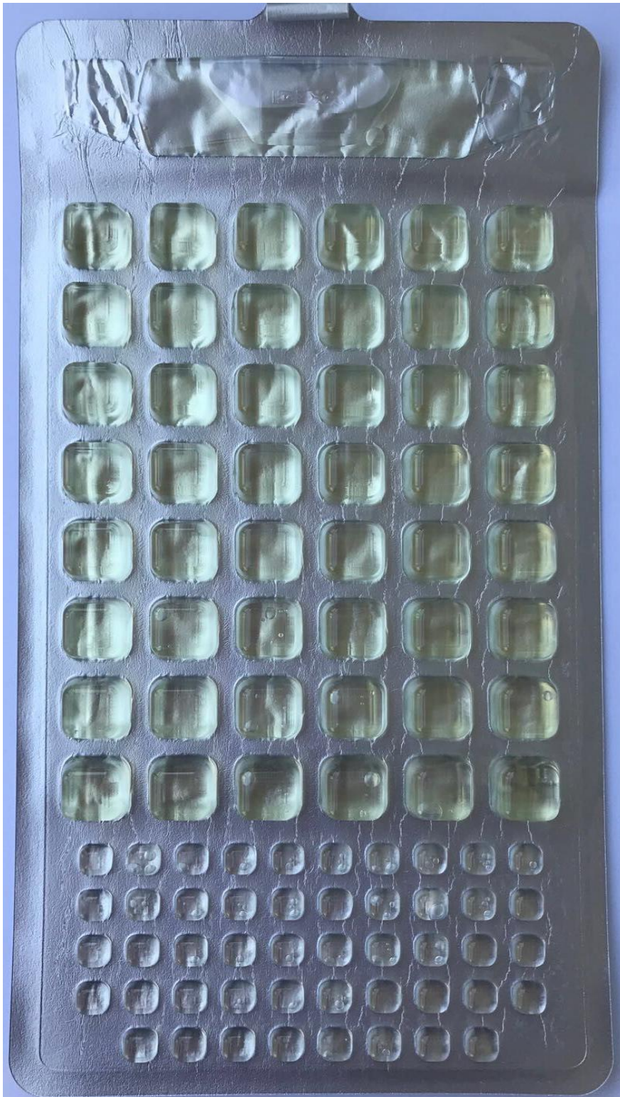
图 A.3 标准阳性比色盘