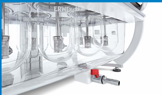
Easy to clean one-piece moulded water bath with outlet valve