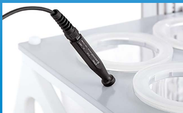
Electronic temperature sensor for permanent check of bath temperature