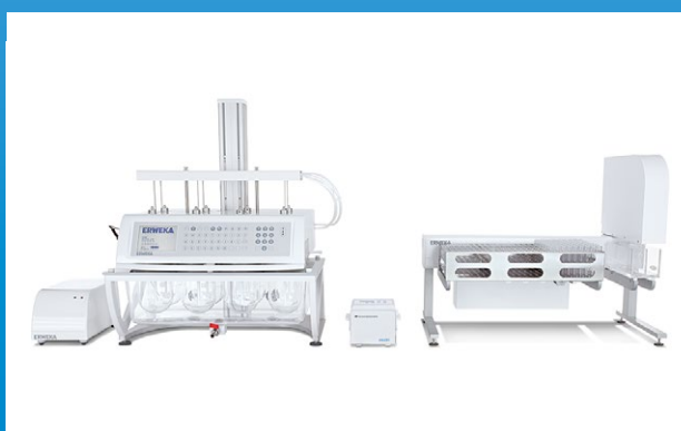
The DT 828 with optional automated sampling station controls offline system

Technical specifications of products described are stated without warranty and subject to change any time without further notice.