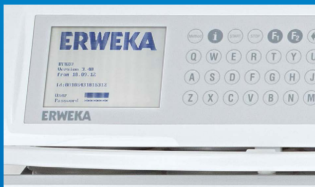
The DT 820 series comes with built-in intelligence like large memory and system suitability tests