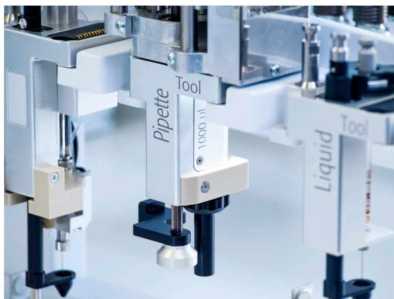
Fig. 2: Pipette Tool placed in Park Station

http://www.palsystem.com/index.php?id=284