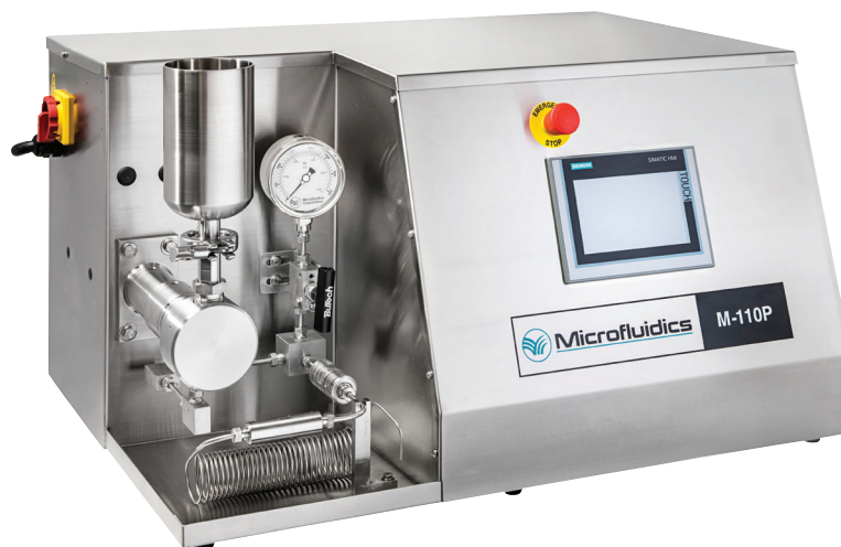
Model shown is subject to change depending on options selected.