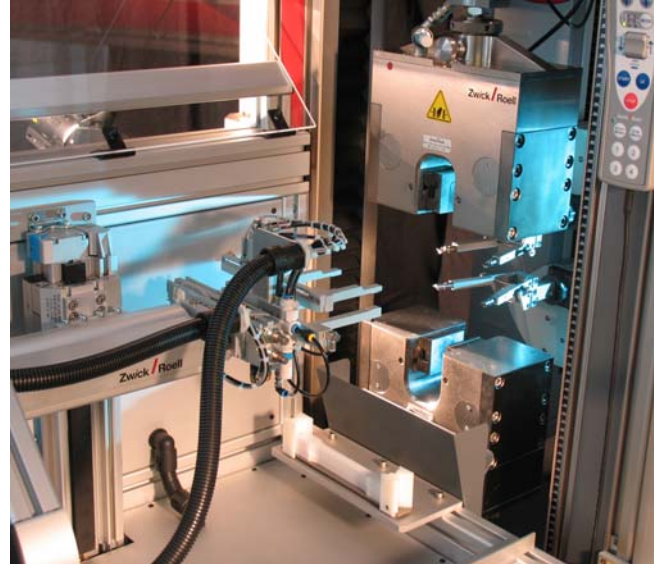
Pincer gripper removes a specimen from the magazine