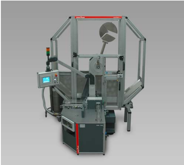
Robotic testing system 'roboTest I' for pendulum impact tester RKP 450 or PSW 750