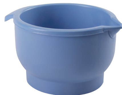
Large Cool-It bowl for flasks up to 2 litres