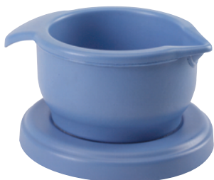
Small Cool-It bowl for flasks up to 400ml

The safest and most efficient way of cooling and stirring round bottom flasks to -78^{\circ}\text{C} .