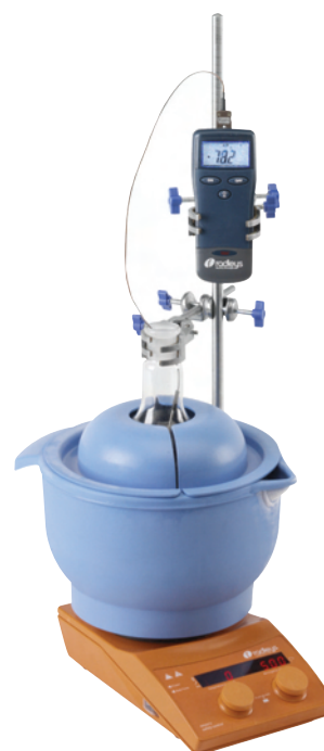
Large Cool-It bowl with lid, stirrer, stand and digital thermometer