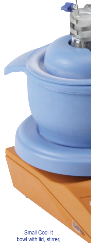
Small Cool-It bowl with lid, stirrer, stand and digital thermometer