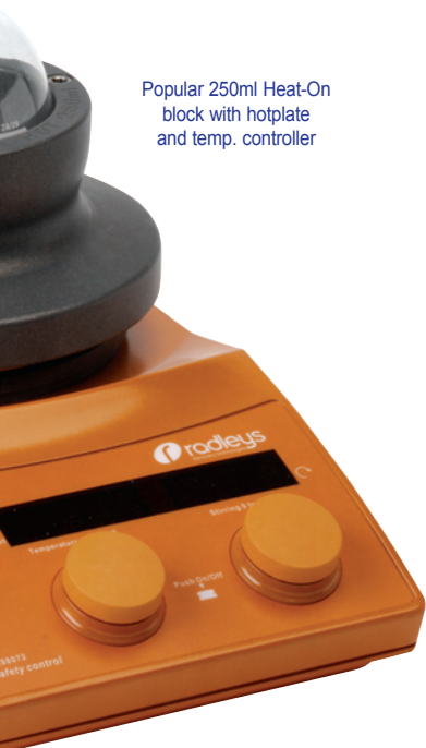
Popular 250ml Heat-On block with hotplate and temp. controller