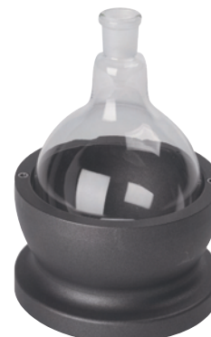
1 Litre Heat-On block