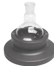
250ml Heat-On block

Each Heat-On block (250ml, 500ml, 1 litre, 2 litre, 3 litre & 5 litre) is a stand-alone product that can be placed directly onto your stirring hotplate - these blocks do not use reducing inserts to accept smaller flasks, thereby maximising heat transfer from a single piece design. All single well blocks feature two probe holes and accept the optional safety lifting handles.