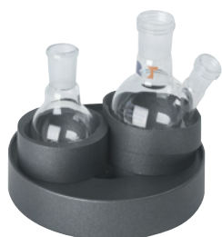
Heat-On Multi-well Block Holder with 50ml and 100ml flask inserts