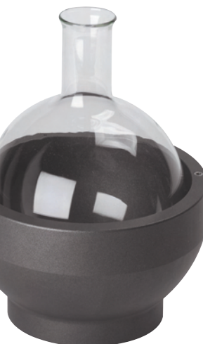
5 Litre Heat-On block