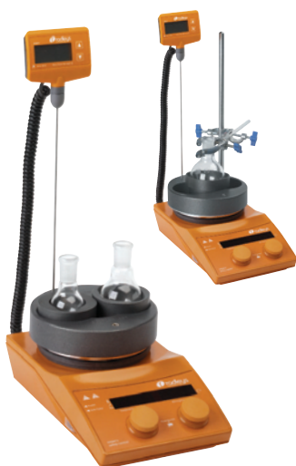
Multi-well Block Holder can accept one or two inserts as required.