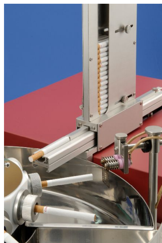
Autofeeder for Cigarette