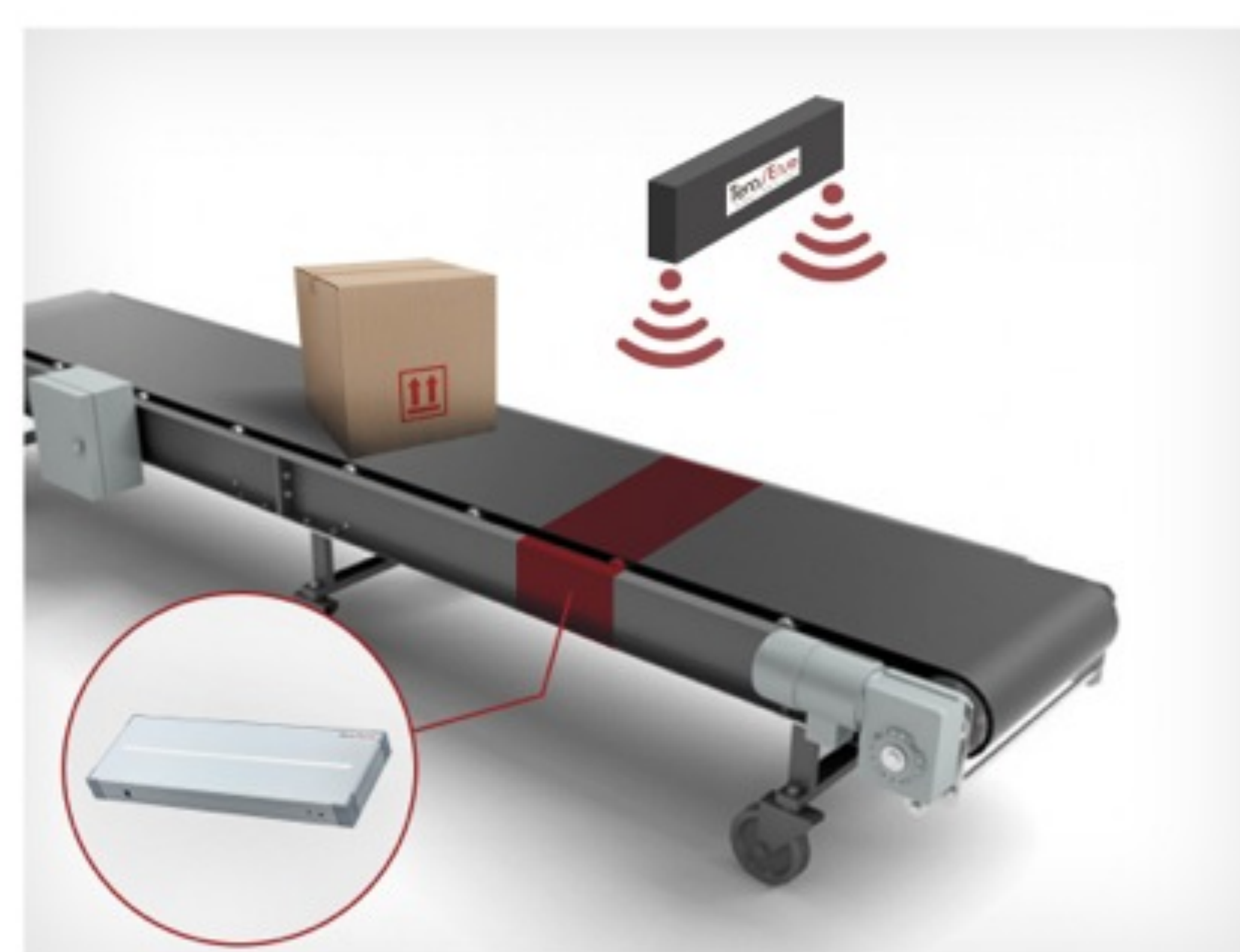
Layout for Linear Terahertz Imaging System installation on conveyor