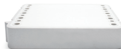
Pellicon® 3 Cassette (1.14 m 2 )