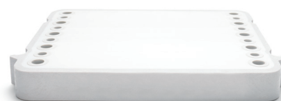
Pellicon® 3 Cassette (0.57 m 2 )