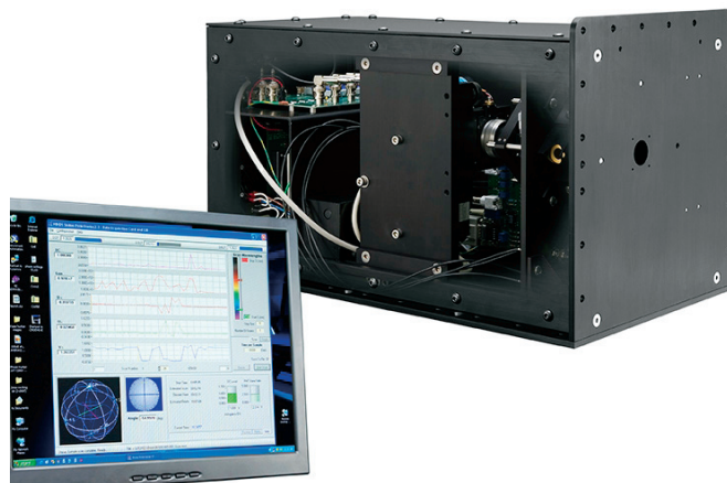
Stokes polarimeter configured for astronomical research