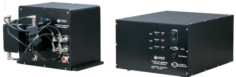
Stokes Polarimeter. Optical Module (l), Control Module (r)

The electronic signals can be processed through either Fourier analysis of waveforms or lock-in amplifiers depending on the requirements of a specific application. A software algorithm, developed by Hinds Instruments, converts the signal levels from the electronics module into parameters from which Stokes parameters can be determined. The