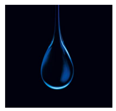
Droplet to be measured by Laser based IPS system

As an integral component of an industrial printing solution, IPS' overall purpose is to create and maintain a stable, high-quality printing process.