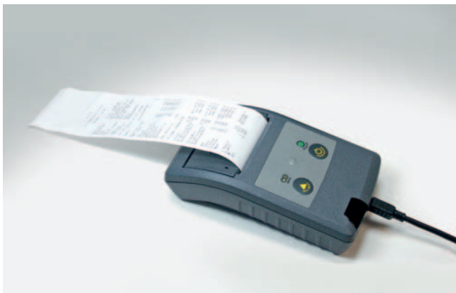
Portable report printer