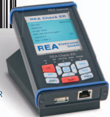
REA Check ER