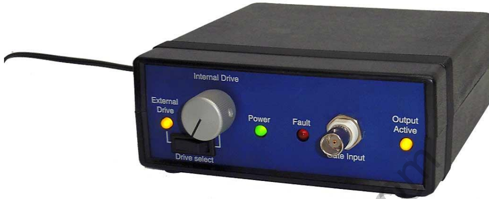
FLC Driver sold separately

控制器是 Meadowlark 专门针对超快铁电液晶光阀/光学快门进行优化的理想的高性能控制器。