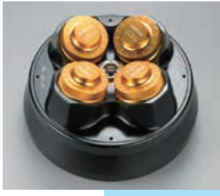
A-1K4 4 x 1,000mL