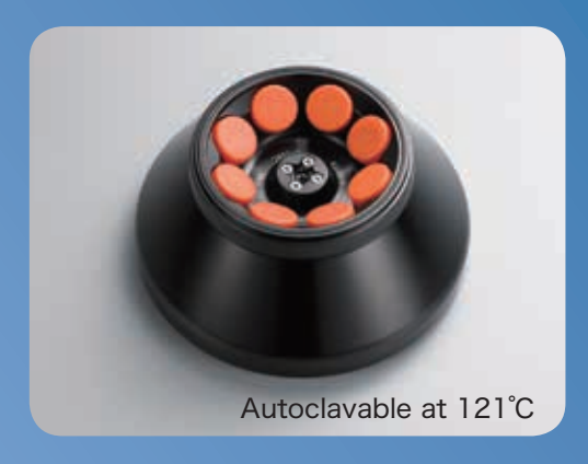
A-508C 8 x 50mL 16,500rpm, 36,530xg for model 7000

By lowering rotating-speeds to prevent tube breakage, the use of specific conical tubes is not required.