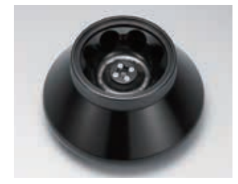
A-508 8 x 50 mL

• Tube adaptors are available in various capacities. Please contact our distributor for further details.