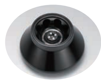
High speed rotor A-506, A-508, A-1008, A-5004, A-5006

For 10/50mL Oak Ridge type tubes and 250mL bottles