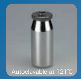
500mL Code No.052-0060