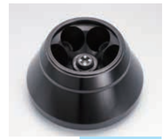
A-2506 6 x 250mL