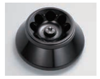
A-1008 8 x 100 mL

• Tube adaptors are available in various capacities. Please contact our distributor for further details.