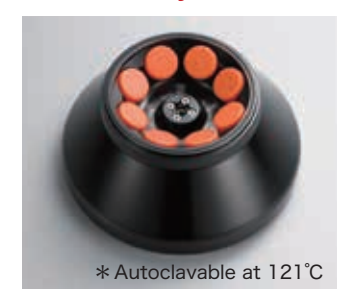
A-508C 8 x 50mL Conical tube 8 x 15mL Conical tube*

By lowering rotating-speeds to prevent tube breakage, selecting specific conical tubes is not necessary. Commercially available conical tubes can be used.