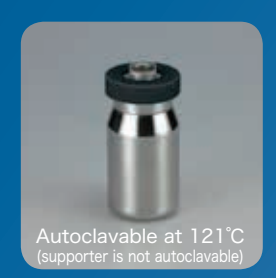
250mL Code No.052-0050