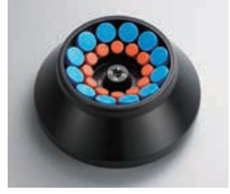
A-6512C 12 x 50mL Conical tube 12 x 15mL Conical tube

* Code No. 055-1250 adaptor is required.