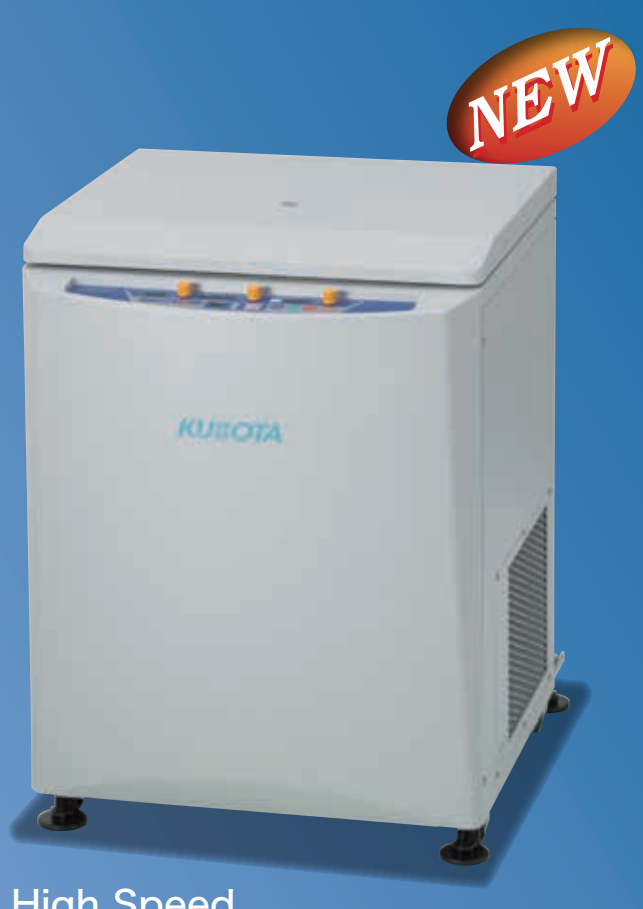
High Speed Refrigerated Centrifuge Model 7000