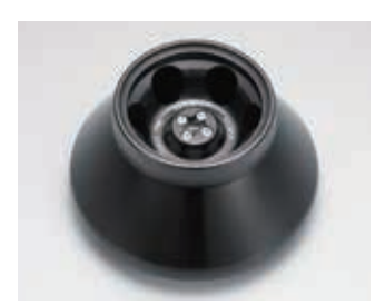
A-506 6 x 50 mL

• Tube adaptors are available in various capacities. Please contact our distributor for further details.