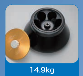
6 x 500mL A-5006