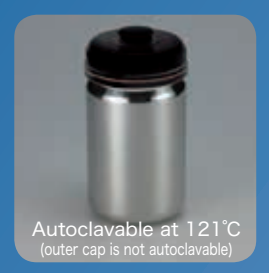
1,000mL Code No.052-7080