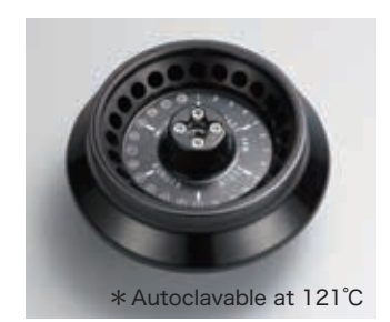
A-224 24 x 1.5/2mL 24 x 0.5mL 24 x 0.4mL 24 x 0.2mL PCR

* There is a limit to the number of times rotors can be autoclaved. Please refer to the instruction manual for details.