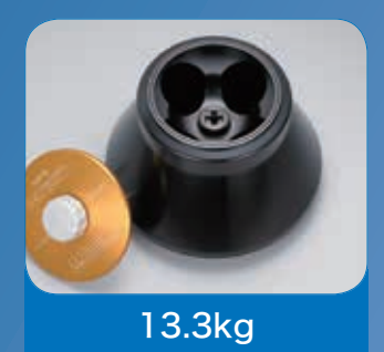
4 x 500mL A-5004