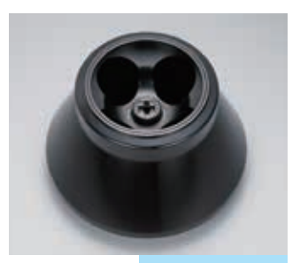
A-5004 4 x 500mL