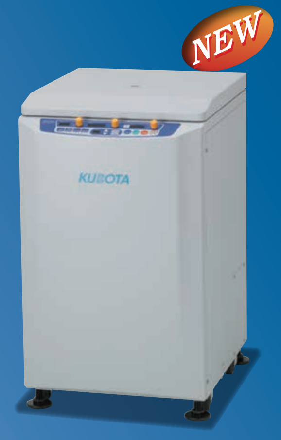
Compact High Speed Refrigerated Centrifuge Model 6000