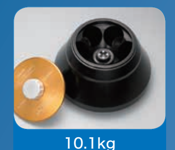
6 x 250mL A-2506