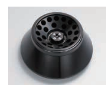
A-1224 24 x 12 mL