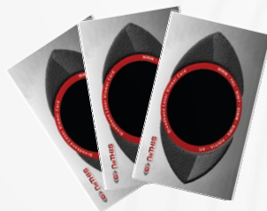
TCrit-40 TCrit-50 TCrit-70