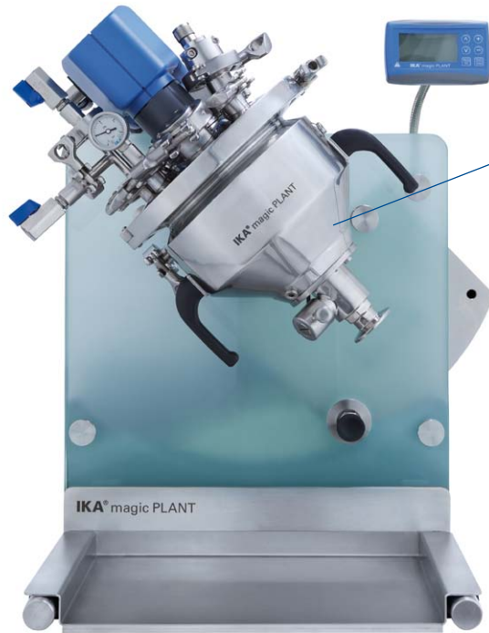
Inclined working position for perfect mixing