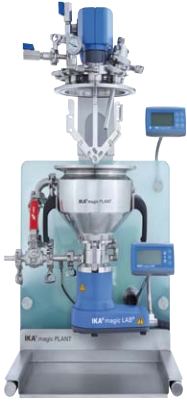
Vessel cover can be lifted by means of electrical spindle