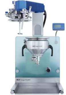
Cover with agitator can be swiveled aside for easy product feeding.