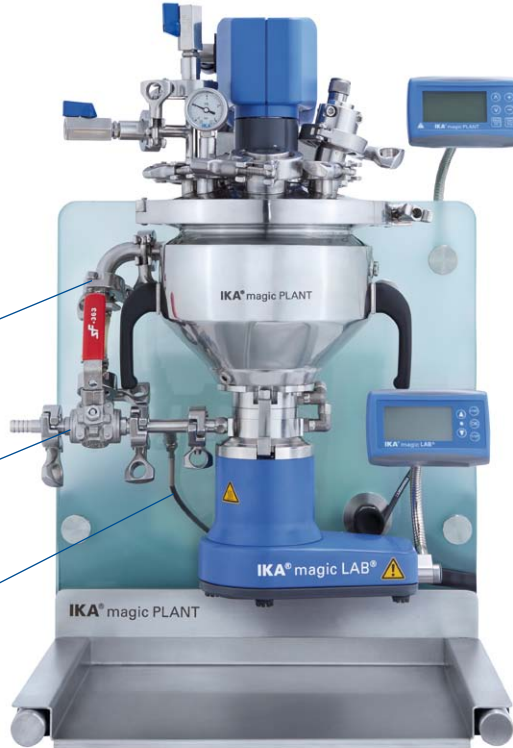
PT 100 in the circulation loop