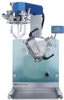
Discharge by complete tilting of the drying vessel