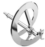
Special powder agitator

Efficient but gentle mixing of all free flowing solids, including products with different bulk densities and particle sizes. Mixing is done by means of a special spiral agitator, intensively mixing the product in radial and tangential directions. Inclined position for optimum drying of various humid solids of different free flowing behaviour as well as different bulk densities at uniform humidity and temperature distribution in the whole product area