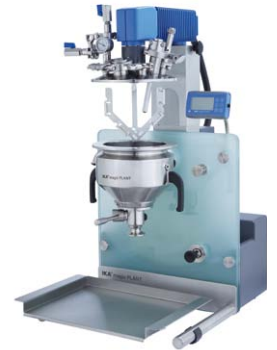
Tray can be removed