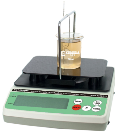
標準配件：玻璃砝碼組合 Standard accessory: Glass weight

Principle: When testing Brix °Bx, it adopts buoyancy method of Archimedean principle; after calculation by the special software, the density, Brix °Bx, alcohol content PA, Concentration % of the sugar solution can be showed rapidly.