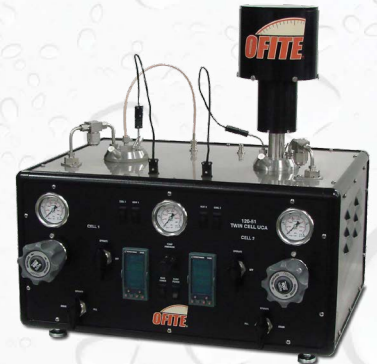
A Single SGSM Unit on a 5,000 PSI Twin Cell UCA