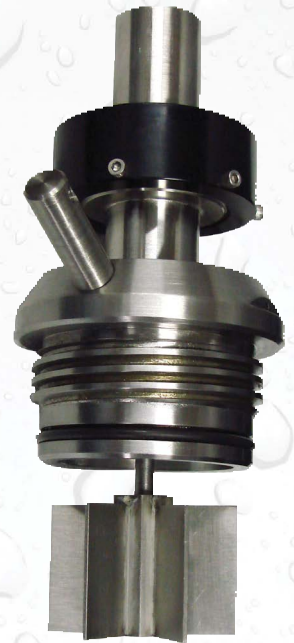
SGSM Cell Cap Assembly