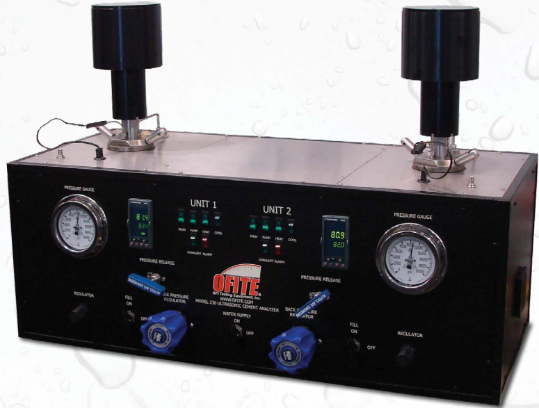
Two SGSM Units on a 20,000 PSI Dual Cell UCA

The Static Gel Strength Measurement (SGSM) device uses a vaned bob to condition a cement slurry inside a pressurized test cell and intermittently measure static gel strength at down-hole conditions. By directly measuring the forces required to initiate movement in the sample, the SGSM provides an accurate way of determining the static gel strength.