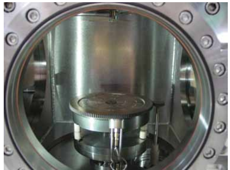
Sputtering Chamber with Rotating, Heated and Biasable Platen