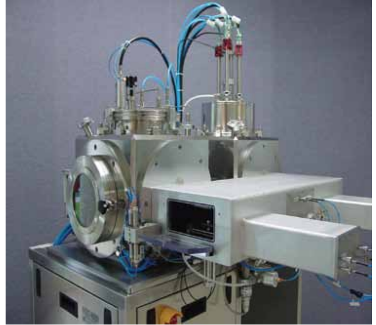
Load Lock and Automatic Transfer Between Chambers w/o Exposure to Atmosphere