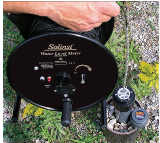
Measure Water Levels within the narrow channels of a Solinst CMT® System.

The 102M Mini Water Level Meter is available in 80 ft. and 25 m lengths. There is the choice of the P1 or P2 Probe with segmented weights.