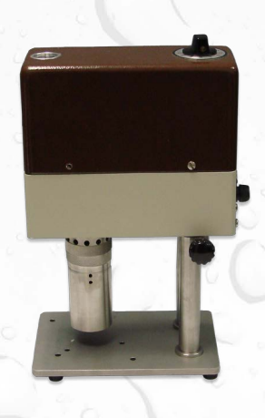
130-10-L - Model 800 8-Speed Electronic Viscometer With Retractable Legs (For Kits)