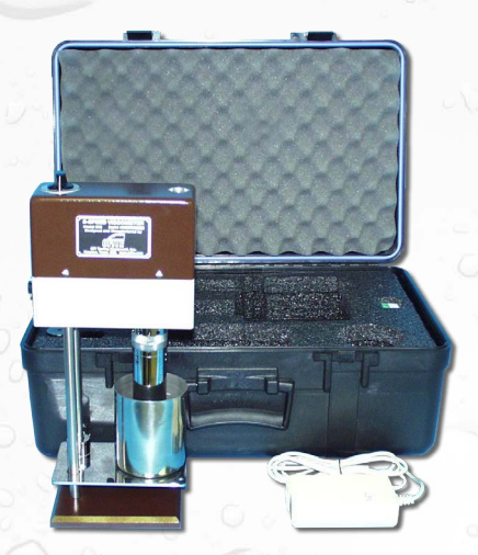
130-10-C - Model 800 8-Speed Electronic Viscometer With Carrying Case and Power Supply

The Model 800 8-Speed Electronic Viscometer is designed and exclusively manufactured by OFI Testing Equipment, Inc. It is extensively used worldwide in both the field and laboratory for the precise measurement of Rheological properties of fluids.