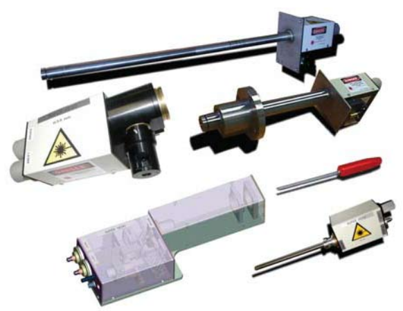
Superhead industrial Raman probes