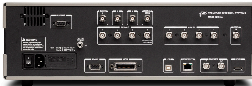
SR865 rear panel